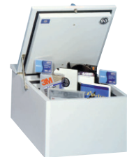
Optional Data Protection Insert FSDPI09