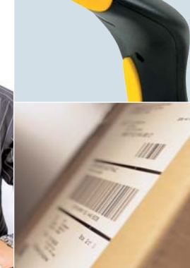
Big Business Tools. Small Business Attitude.

The Wasp WCS 3900 series scanners are the most popular bar code scanning devices in our product line. Manufactured from light weight ABS plastic for durability, and our exclusive ergonomic design for comfort and ease of use, make the WCS 3900 and WCS 3905 bar code scanners the best in their class. For fast connection, the WCS 3900 simply plugs between your keyboard and PC, or if you prefer USB, the WCS 3905 is the scanner for you. Both scanners send data to your active application as if you typed it from your keyboard. Designed for retail, point of sale, or any repetitive application where time and accuracy are important factors in making your business succeed. Optional stand available for hands free scanning applications!